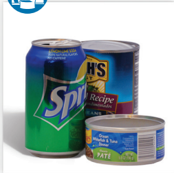
Aluminum and Steel Cans empty and rinse