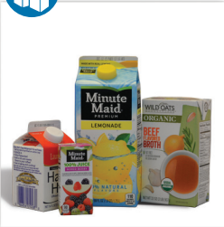
Food and Beverage Cartons empty and replace cap