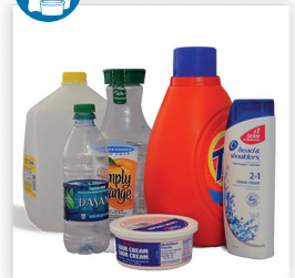
Kitchen, Laundry, Bath: Bottles and Containers empty and replace cap