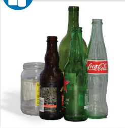
Bottles and Jars empty and rinse